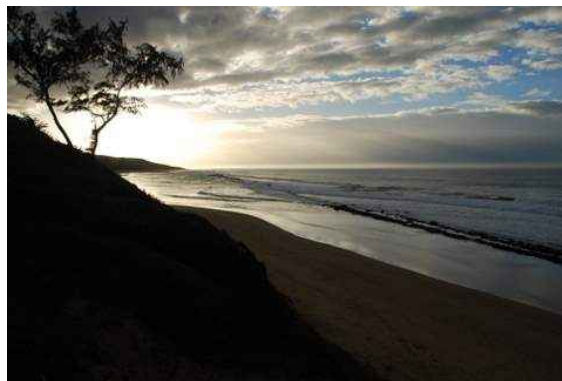
The Indian Ocean – a two-minute walk from where the women stayed

bikes and motorcycles are ambushed by bands of lawless opportunists. Rural Mozambicans are much friendlier, but there is even less protection in the wilderness than in the cities, and if opportunists happen to pass a stranded motorist late at night, the situation can turn dangerous. Friends in Nampula aware of our predicament contacted a missionary couple 50 miles away who hurried out to whisk the women folk away to their safe haven on the Indian Ocean while Kent, Andrew, and I stayed with the car to discourage would-be looters.