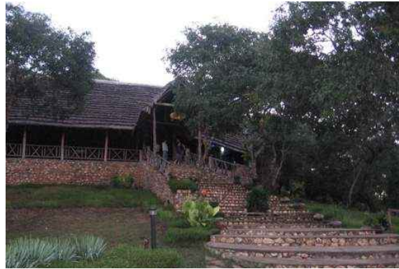
Suffering in style!

Rover we were carrying only a single spare wheel whereas formerly we always took two when traveling through the wilderness. Because the tire was destroyed after the blow out, we had to stop at the next large town to find a new spare before another flat left us stranded in the bush. We were grateful to find a suitable tire after only four hours of searching, but the delay caused us to arrive at the Zambeze River three minutes after the ferry shut down for the day. Those three minutes cost us an additional 13 hours in our timetable. How discouraging! Until recently, that three minute delay would also have necessitated sleeping in the car at this desolate location, but just two months earlier a deluxe lodge had been opened by a South African entrepreneur only a few minutes away. We were the sole guests at the still unknown resort, and there we had the most luxurious accommodations of the entire trip. The new dwelling we stayed in was built high on a bluff with a beautiful view overlooking the river. Because of the expense we would not normally have contracted such extravagant lodging, but as we had little choice in the matter, we suffered it to be done thus unto us!