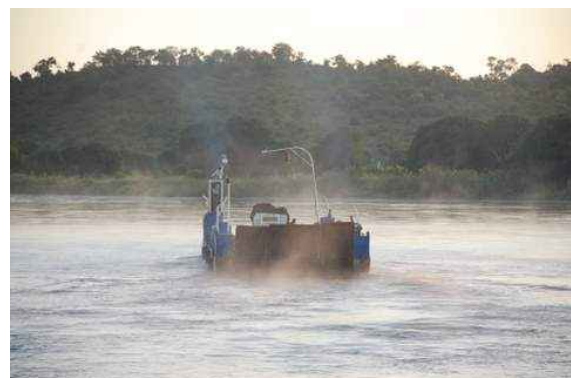
Crossing the Zambeze River by ferry

The trip out was marred first by a blow out on a section of Mozambique's rough unpaved road. This was handled in the routine manner, but with our new Land