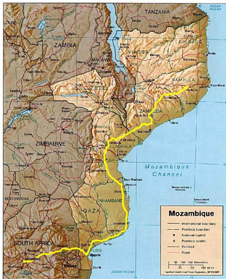
Our route from Nampula to Johannesburg, RSA – 1700 miles