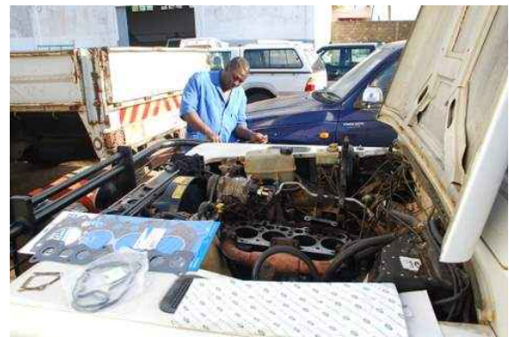
Repairing the head gasket

However, it was not to be. Only 300 miles into the day the engine suddenly overheated and I had to pull off the road. Investigation revealed we had blown another head gasket and our cooling system was filled with air escaping from the cylinders. This was probably my fault for not re-tightening the bolts at the prescribed interval after the first repair. This time we really were stranded in the bush, 50 miles from the nearest town and 170 miles from the nearest shop able to do the repair we needed.