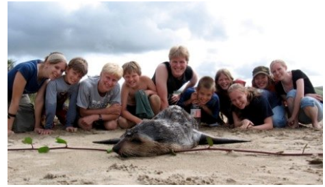
The kids find an exhausted sea lion on one of their beach walks