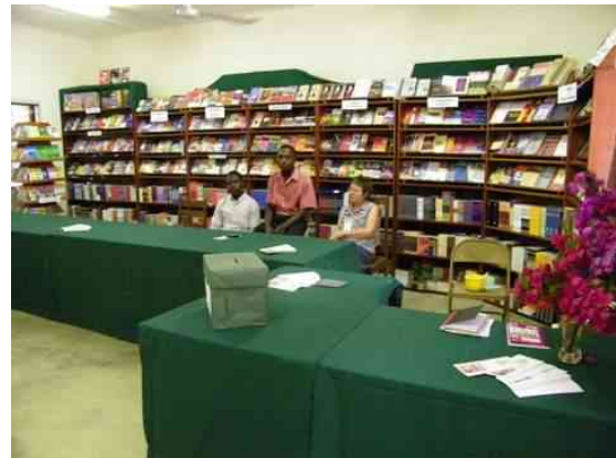
The bookshop beautified