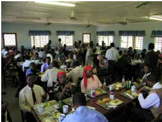
One of three dining areas at the conference

developed over the past 18 years. While I much appreciated the fine teaching on the Christian home and the points that were raised by our speakers, I am convinced that the single most important element in transforming our families, churches, and communities is regular worship in the home consisting of daily instruction from the word of God, time spent praising Him through excellent hymns and choruses, and prayer on our knees as family members beseech God in behalf of their communities and one another. The family that repeatedly reads through the whole Bible together ends up covering every conceivable matter that needs to be addressed in preparing children for life in this world (II Tim. 3:16-17). Potential problems get worked out at the family altar even before they can manifest themselves - or perhaps family worship simply brings down God's special protection from divisive influences and the multitude of sorrows that can easily befall any home.